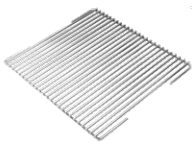
Extra grill [GMH300P]