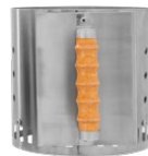
Charcoal Starter [CS2]