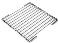
Extra grill [GMH150]